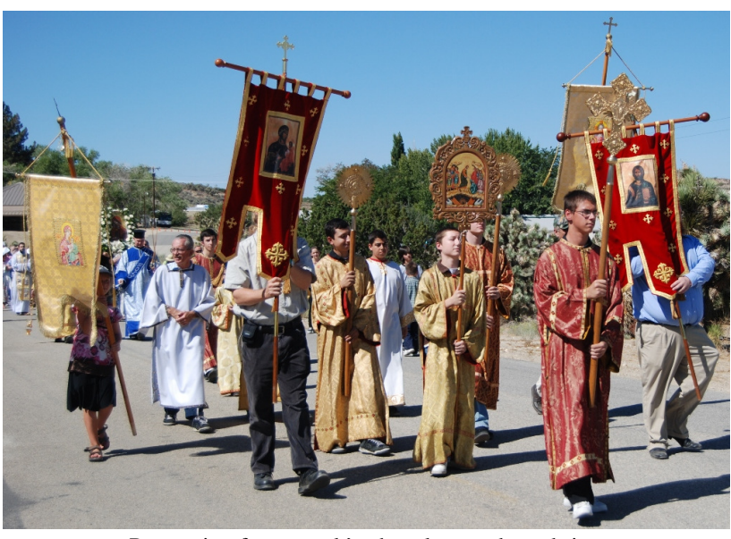
Procession from monk's chapel to outdoor shrine

The two monastic communities were delighted to be able to give an example both powerful and practical of the deep unity of the Church in its Eastern and Western traditions. For this reason it is hoped that this pilgrimage may be repeated next year, and that it might attract an even wider attendance from Christians from around the Southland.