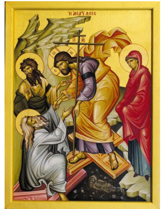
Icon of the Anastasis (Descent into Hades).

In 2010, Eastern and Western Church Calendars coincided so that all Christians celebrated the Feast of the Resurrection on the same day. The dates for the Holy Day will coincide again in 2011, but will vary again after that. As we remember the joys of a common date this year, we look forward to the entire Christian world proclaiming the joy of the Resurrection together again next year. We are convinced that the time is at